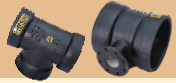
TABLE - 21 Contd.